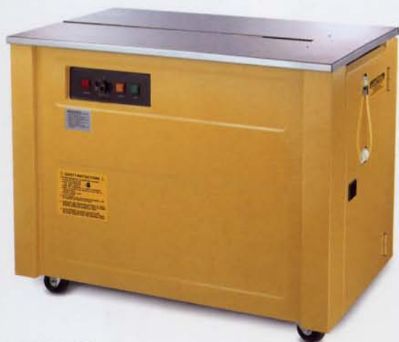
AAM-613 INSTANT HEATING TYPE STRAPPING MACHINE