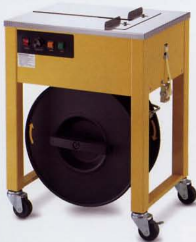
AAM-612 DESK TYPE STRAPPING MACHINE