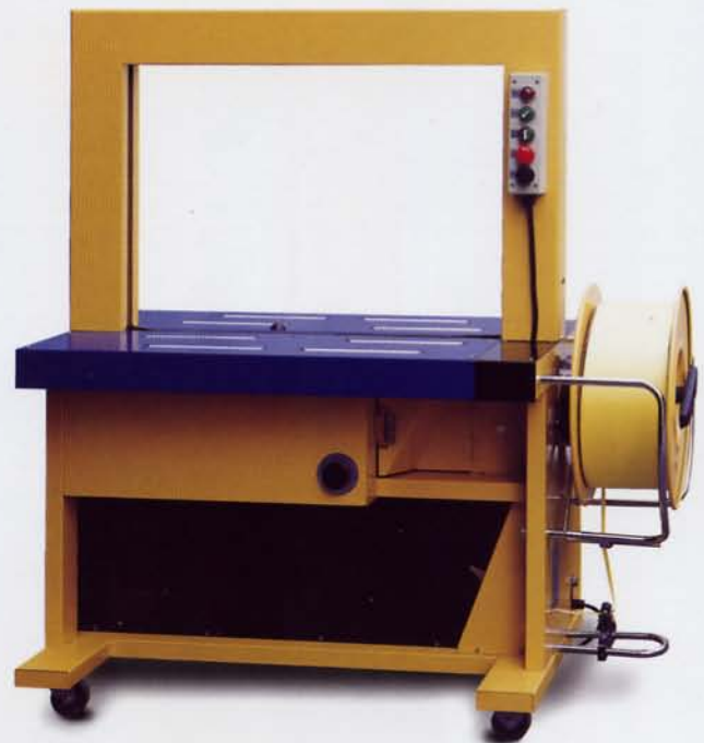
AAM-616 AUTOMATIC STRAPPING MACHINE