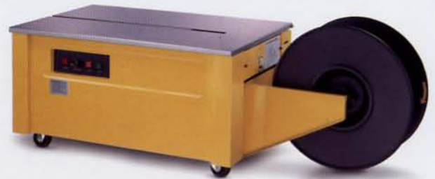
AAM-611 LOW BED TYPE STRAPPING MACHINE