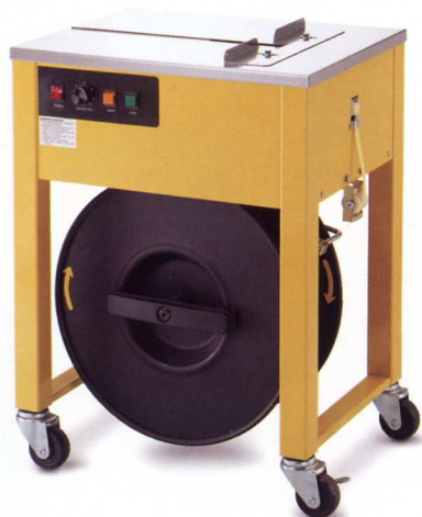
AAM-612 DESK TYPE STRAPPING MACHINE