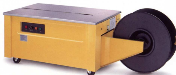
AAM-611 LOW BED TYPE STRAPPING MACHINE